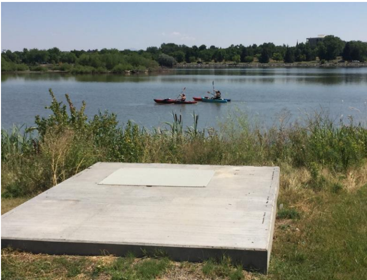
Viewer site in West Bank Park